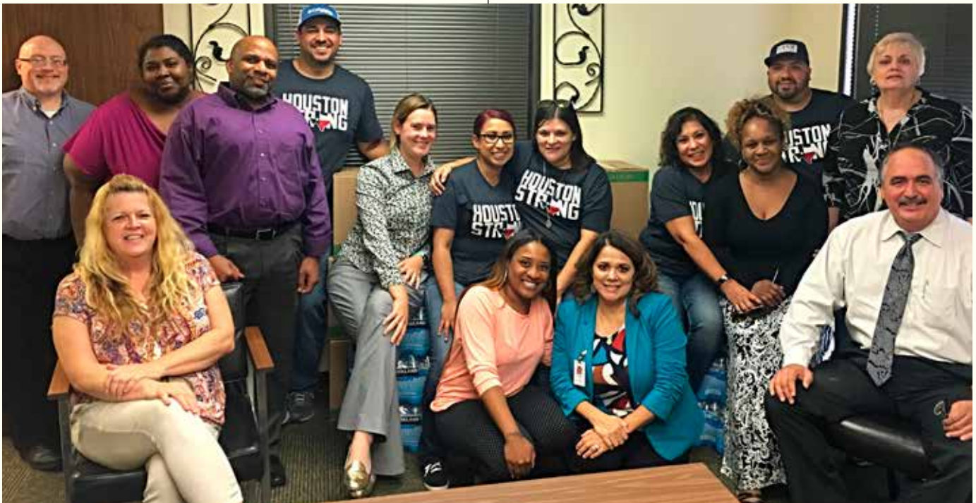
Comptroller volunteers delivered care packages and water to fellow employees in the Houston office.

The Comptroller's office is here to help Texans, from expedited purchasing of emergency equipment and supplies, special licenses for motor fuel imports, tax deadline extensions and more. We'll continue to assist in this situation and any other that arises. ■