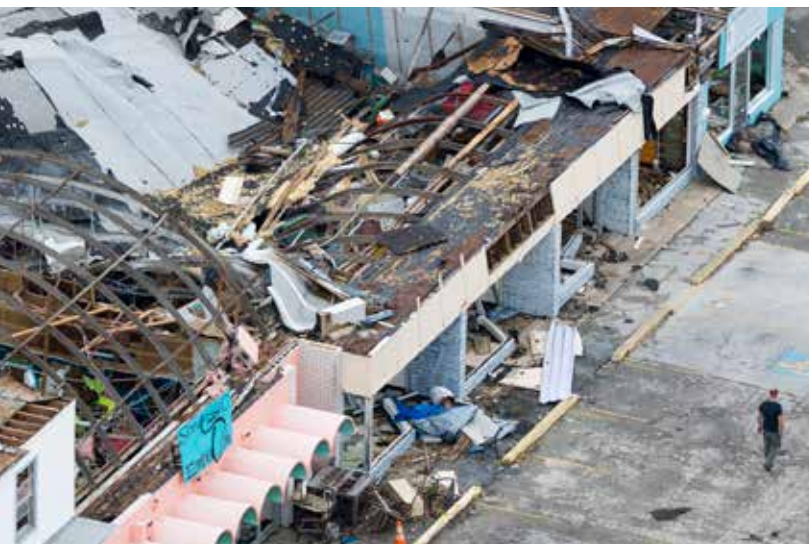
Aftermath of Harvey in Rockport, Texas.

Harvey also exacted a high cost on many of the state’s industries. According to the Texas A&M AgriLife Extension Service’s most recent estimates, the storm caused more than $200 million in Texas crop and livestock losses. 5 The coastal tourism industry suffered crippling damages, especially in Rockport-Fulton, where the Chamber of Commerce estimates winter tourism was down by 50 percent. Other economic sectors — particularly