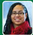
REBECA CLAY-FLORES Commissioner Precinct 1