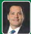
JUSTIN RODRIGUEZ Commissioner Precinct 2