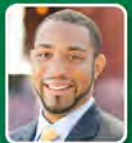
TOMMY CALVERT Commissioner Precinct 4