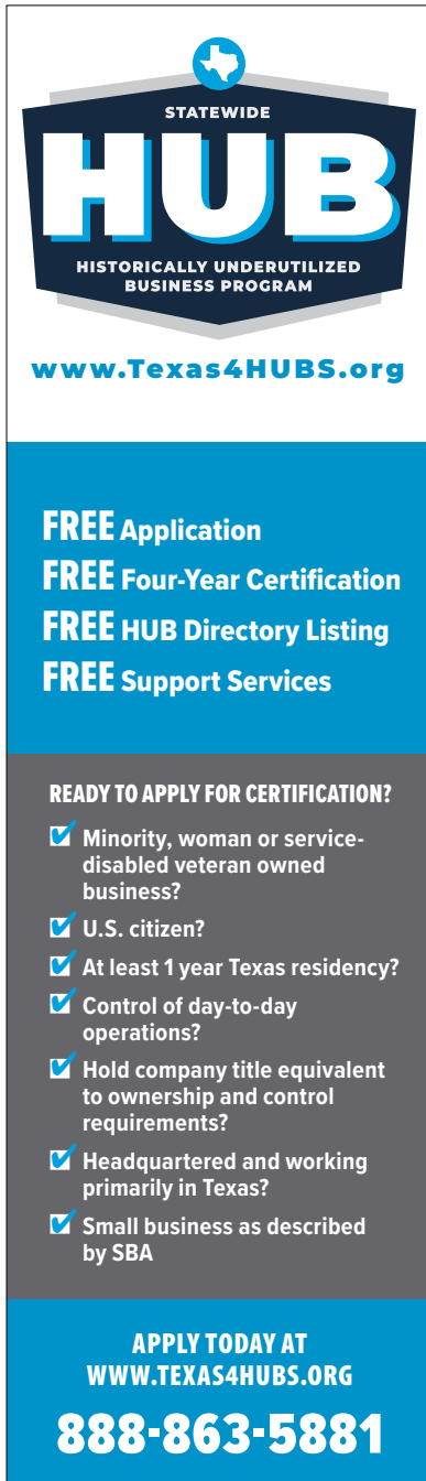
HUB Promotional Bookmark