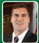
GRANT MOODY Commissioner Precinct 3