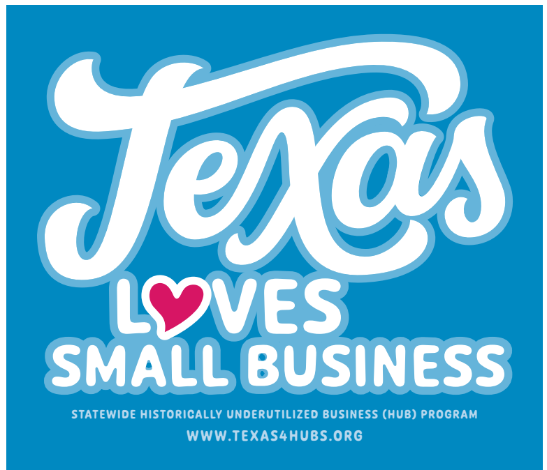
HUB Promotional Sticker